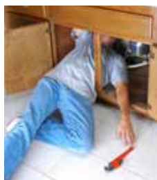
Plumbing is not a do-it-yourself project. Consult a professional!

Today’s technology allows for sewer lines to be replaced by a new trenchless method. This saves your yard, porch, patio and landscaping considerable damage.